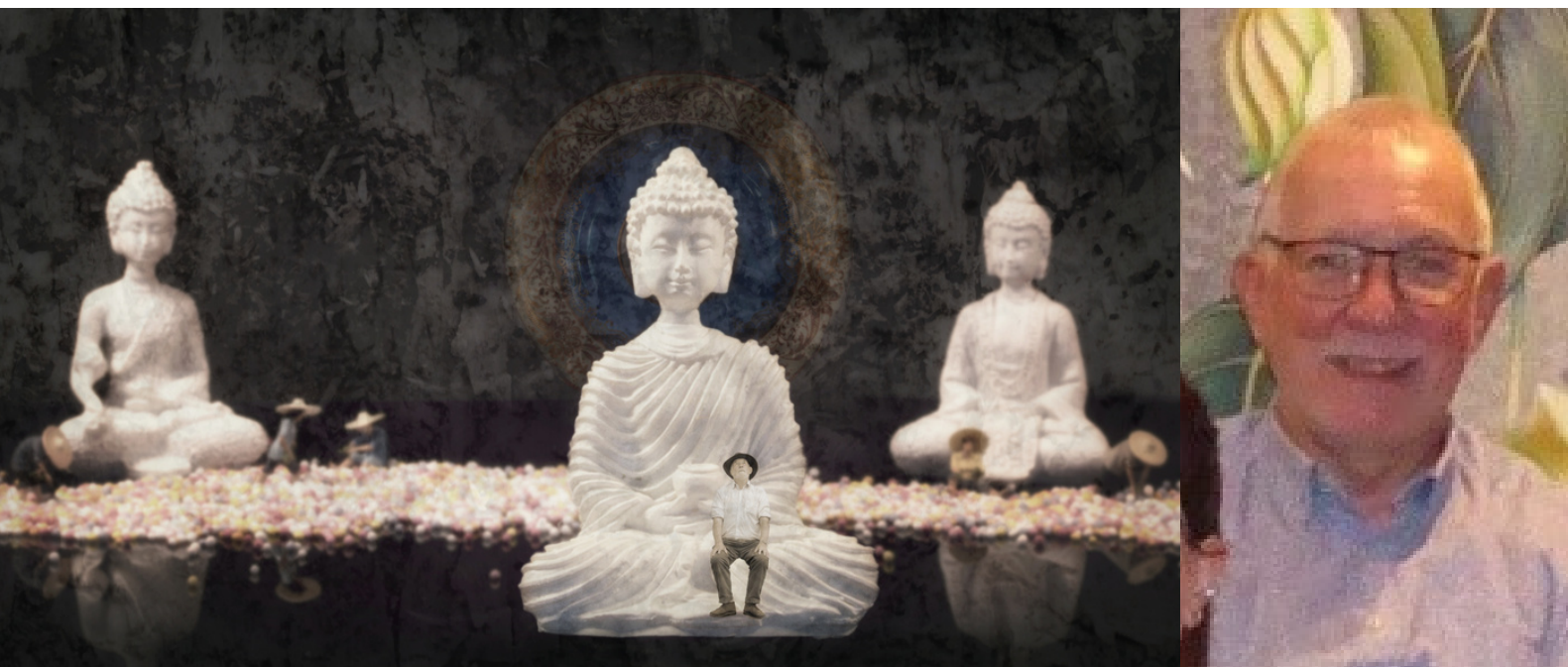
An image from Brendan's AV presentation entitled "The Traveller", that has had success in national and international audio visual competitions, demonstrates his use of miniature figures in his work.

Problems with mobility led him to turn towards table top photography and this also became a very strong motivating activity during the lockdowns of Covid. Brendan fell into the world of using miniatures quite deliberately as he wanted to try something more unique and has found the task of creating dioramas challenging and stimulating. Sourcing miniature figures was initially trial and error until he discovered Preiser figures, a well-established German company that produces realistic miniature figures which are used for architectural models and model railways as well as in advertising and art. Brendan uses mostly figures of 1:87 in scale, approximately the height of a fingernail, and to preserve the illusion of reality these are best placed in juxtaposition to larger objects. The limitations are that the figures are static and therefore cannot be manipulated into different positions; they are locked in their expression, stance and dress. However, the scenery, camera angle, lighting, focal length can all be changed to build interest and variety in images. Part of the illusion is to see the figures and their surroundings as life-sized. It is difficult though to make the little figures stand securely, especially on irregular surfaces and many fixatives have been tried and dismissed. Brendan's audio visual presentations have achieved success in national and international AV salons, including a FIAP Gold Medal.