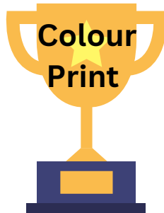
Gougane Barra